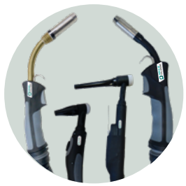
Manufacture of welding torches

TORCHES SOLUTIONS is the assurance of welding solutions adapted to your needs: