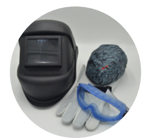
Personnal protective equipment